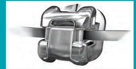
The Damon® System

Damon® System braces use a passive slide mechanism to maintain archwires within the bracket, allowing them to move more freely.